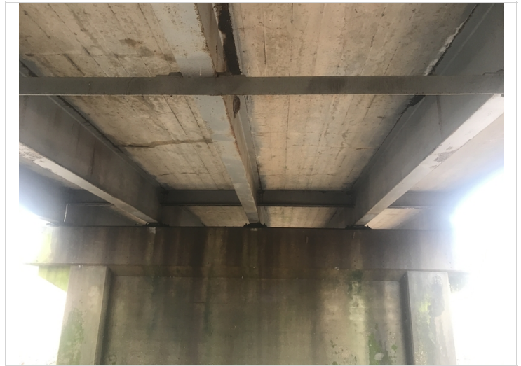
Under photo Span #2