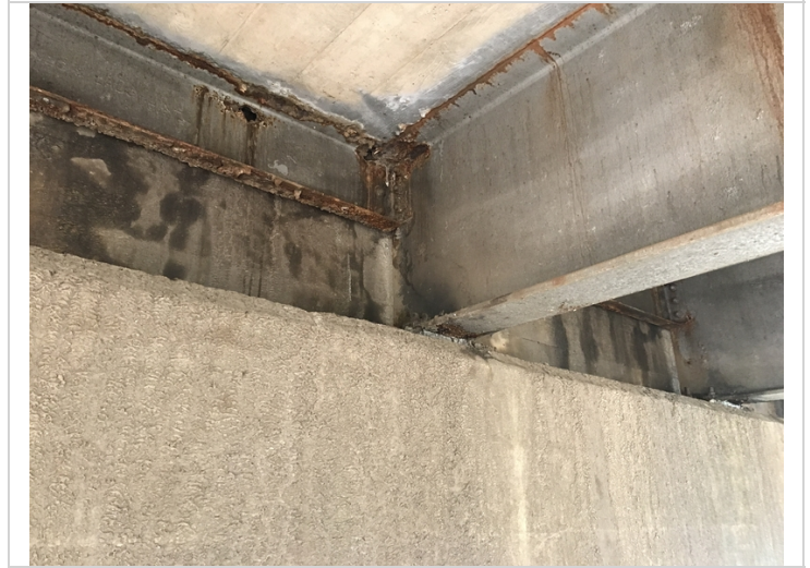
Various beam ends have section loss