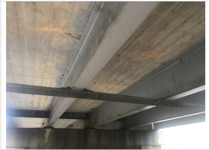
Typical under deck photo