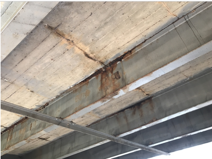
Underside of deck typical all spans 2/2022