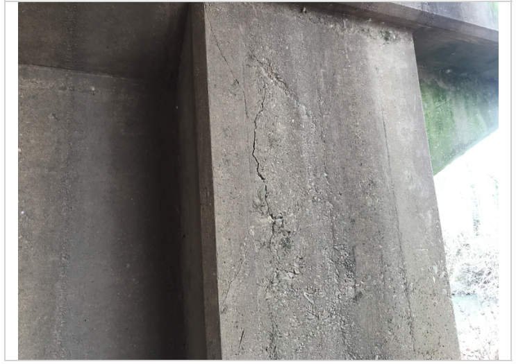
Bent 2 column 2