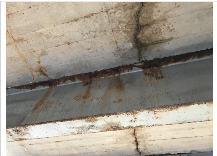
Corrosion on beams