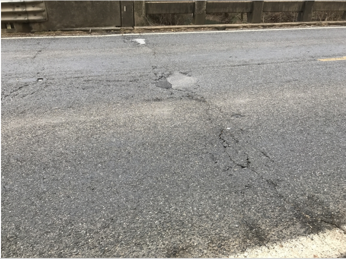
All joints are covered with asphalt