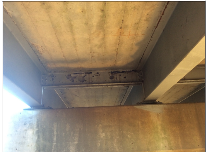
Bent 2 bay 1 diaphragm