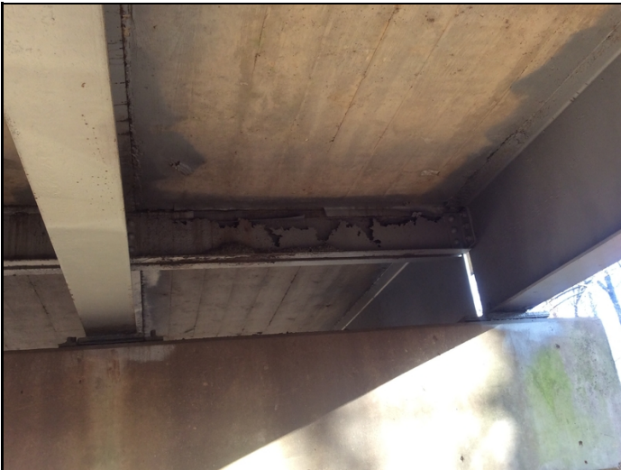
Bent 2 bay 4 diaphragm.